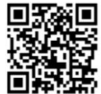
Find support documents, instructional videos, and more at www.hygiena.com