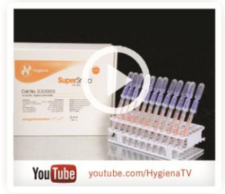
Watch an instructional demo at youtube.com/HygienaTV